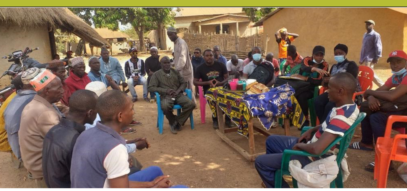
Guinea enumerators collecting data in the field

"To become the leading hub for human trafficking research, policy, and programming development across the globe."