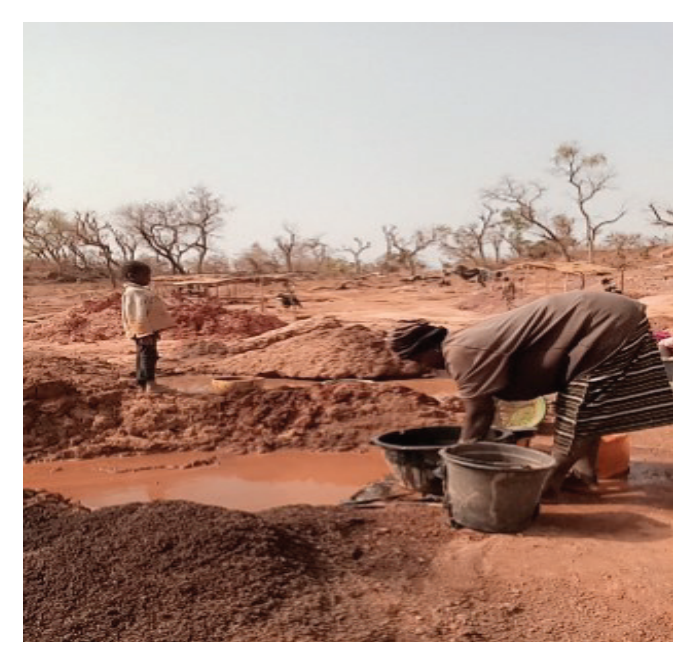
Woman sieving gold at the gold mines in Kharakhena in Kédougou in March 2021

mining sub-sector, a reinforcement of the fight against land grabbing, and an adequate involvement of mining companies. They also mentioned facilitating access to basic social services and economic opportunities for at risk girls and victims, strengthening prevention, protection, law enforcement, internal and border security while creating special units dedicated to the fight against human trafficking.